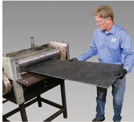
Apply water to activate the adhesive