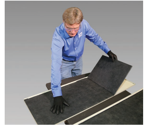
Install the insulation