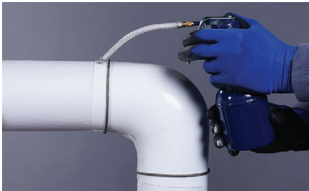
5. Additional jacketing sections are applied in the following manner: run a bead of adhesive around the circumferential edge of the most recently installed section. Position the jacketing and bond the circumferential and longitudinal laps as in step #4. When finished, visually check the entire installation. If necessary, use the adhesive to touch up seams, paying particular attention to points where seams were covered by elastic cords or PVC tape. Complete curing of the Perma-Weld adhesive takes approximately 8 to 10 hours.