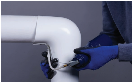
2. Using a standard applicator gun or squeeze bottle, apply a bead of Perma-Weld adhesive along the throat overlap of the fitting cover. Snap the fitting cover into place and secure with elastic cord or PVC tape. Always feather the adhesive along the seam.