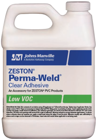
Zeston Perma-Weld low VOC adhesive contains less than 510 g/L volatile compounds and meets California's SCAQMD 1168 Rule

For high-temperature installation, slip-joints shall be applied periodically between fixed supports and on continuous long runs of straight piping. Slip-joints shall be formed by increasing the amount of circumferential overlap to 8 to 10 inches (203 mm to 254 mm) and by applying a white flexible caulking in the overlap area to maintain a sealed system. For refrigerant systems or cold systems in severe ambient conditions, an intermediate vapor retarder shall be applied prior to the installation of the PVC fitting covers and jacketing.