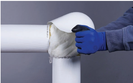
1. Position the Zeston PVC fitting cover over the insulated fitting.

The following sequence describes the installation of Zeston PVC jacketing and fitting covers with Perma-Weld solvent welding adhesive.