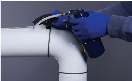
4. Overlap the jacketing on itself (approximately 1½" to 2" [38 mm to 51 mm]) and apply a bead of adhesive along the entire length of the longitudinal lap. Place elastic cords or PVC tape around the jacketing.