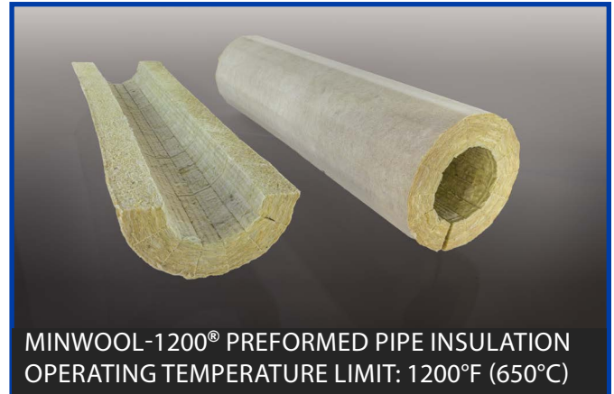
MINWOOL-1200® PREFORMED PIPE INSULATION OPERATING TEMPERATURE LIMIT: 1200°F (650°C)