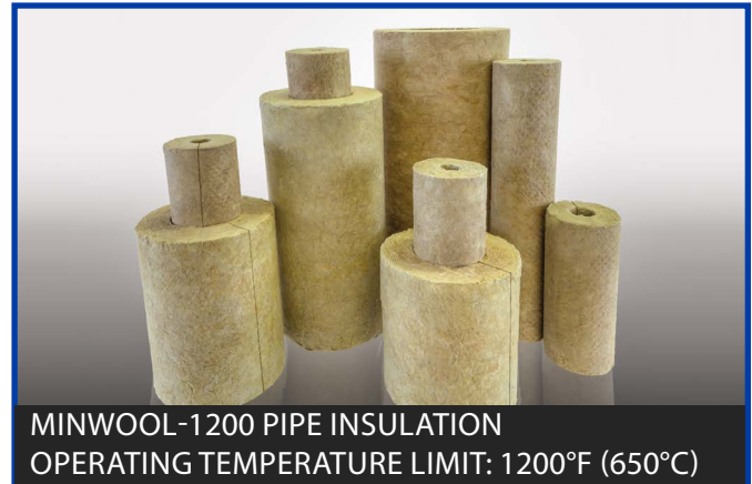
MINWOOL-1200 PIPE INSULATION OPERATING TEMPERATURE LIMIT: 1200°F (650°C)

For pipe sizes 19" to 24" (457 mm to 600 mm), some thick wall pieces are shipped as four piece quads. Thick wall material is furnished in double layers.