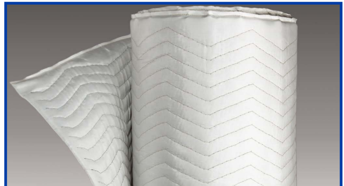
INSULTHIN HT OPERATING TEMPERATURE LIMIT: 1200°F (650°C)

InsulThin HT Insulation is tested in accordance with ASTM C518 and ASTM C335.