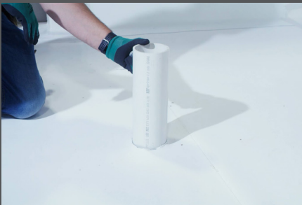
TWE-FP-04: PIPE BOOT