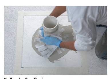
5. Apply the Scrim Immediately roll the JM PMMA Scrim into this layer while it is still wet.