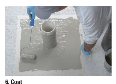
Use a roller brush to work the activated mix resin into the scrim and the horizontal target patch saturating from the bottom up. Note: The liquid membrane should extend 1/4" past the scrim in all directions.