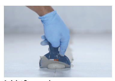
1. Joint Compound

Joint compound applies more simply; just spread over the seam, filling it.