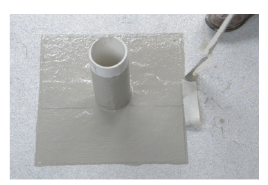
7. After applying the 7" x 7" target over the

The RWWAI/W AoDetailsking and the lower with JM PMMA Catalyst to form a rapid-curing, flexible resin containing chopped fiber reinforcement. It is used in areas where fabric reinforced membranes would be difficult to install.