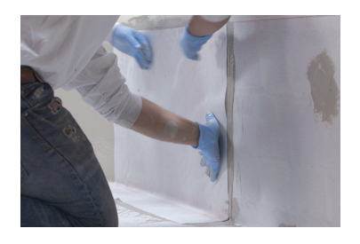
Step 3: Apply an even coat of resin over top of the in-place fleece at a rate of 0.09 kg/ft<sup>2</sup> (1.0 kg/m<sup>2</sup>) using approved rollers. Use caution not to spread resin too thin.

and apply additional resin onto the substrate, then slowly roll the fleece back into the resin, using care to remove any air pockets. It is important to correct these faults before the resin cures, or additional repairs may be required later.