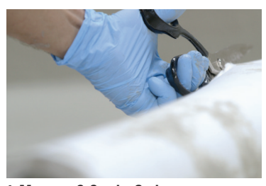
1. Measure & Cut the Scrim

With liquid roofing, measure and cut the scrim to cover the seam. Spread liquid roofing on the seam; then work the scrim into the liquid. Aim for a full, void-free coating: 0.21 to 0.45 kg/ft² (approx. 90 mils thick).