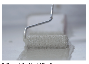
2. Spread the Liquid Roofing Obtain a full coating, without voids, at a ទទ្ធ ប្រាំប្រាស់ទាំងទីដាំខ្លែបាទិវិតាម៉ែល់ទំ នៃ