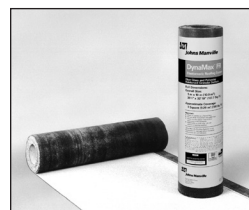
Colors: White or Black

System Compatibility This product may be used as a component in the following systems. Please reference product application for specific installation methods and information.