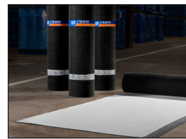
Color: Bright white only

System Compatibility This product may be used as a component in the following systems. Please reference product application for specific installation methods and information.