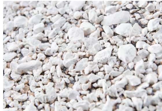
Photo not actual size, granules are shown at approximately 10X magnification.

Reflective Roofing Granules: Bright white granules specifically designed for high reflectivity and durability.