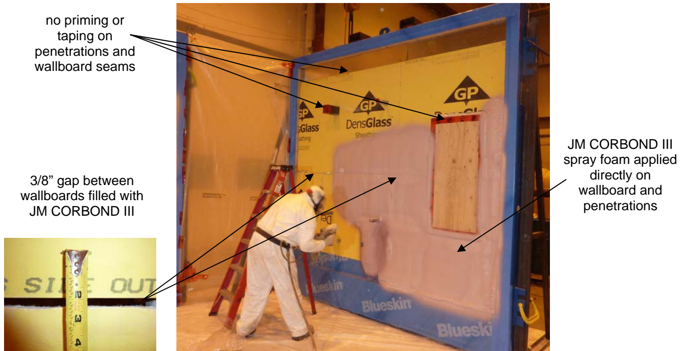
Figure 3. JM CORBOND III ASTM E2357 testing without priming and taping penetrations and wallboard seams.

using standard application techniques - no additional preparation. The superior performance of JM CORBOND III spray foam designed specifically with adhesion promoters results in product characteristics that outperform the other medium density polyurethane spray foams.