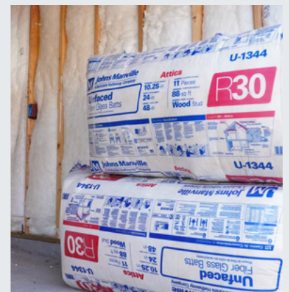
JM Unfaced Fiberglass Batts and Rolls