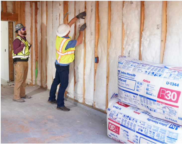
JM Unfaced Fiberglass Batts and Rolls