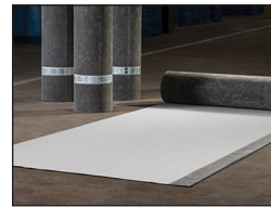
Colors: Bright white only

System Compatibility This product may be used as a component in the following systems. Please reference product application for specific installation methods and information.