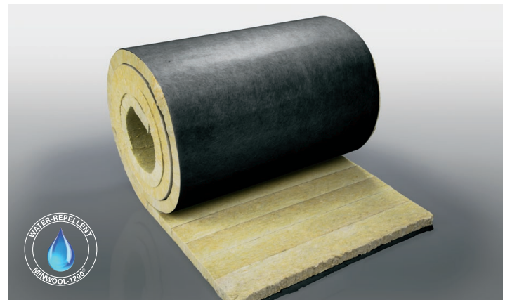
Operating Temperature Limit: 1200°F (650°C)