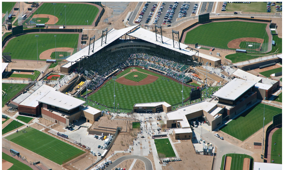
Salt River Fields at Talking Stick, Scottsdale, AZ